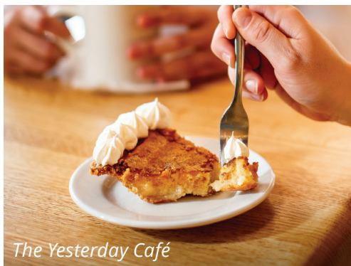
The Yesterday Café