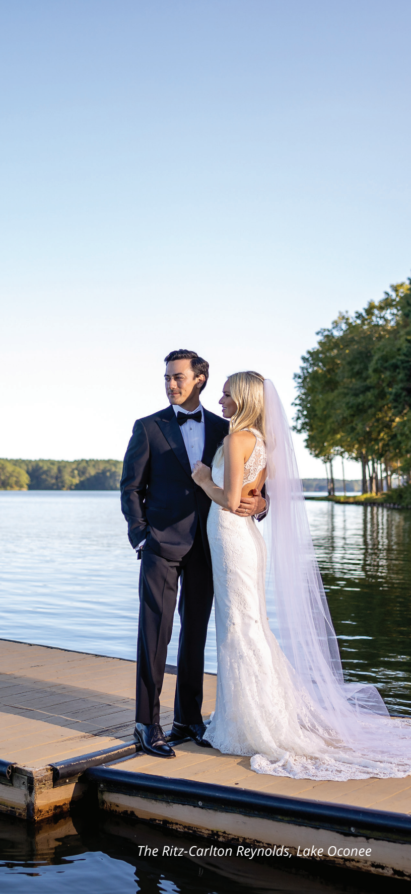
The Ritz-Carlton Reynolds, Lake Oconee