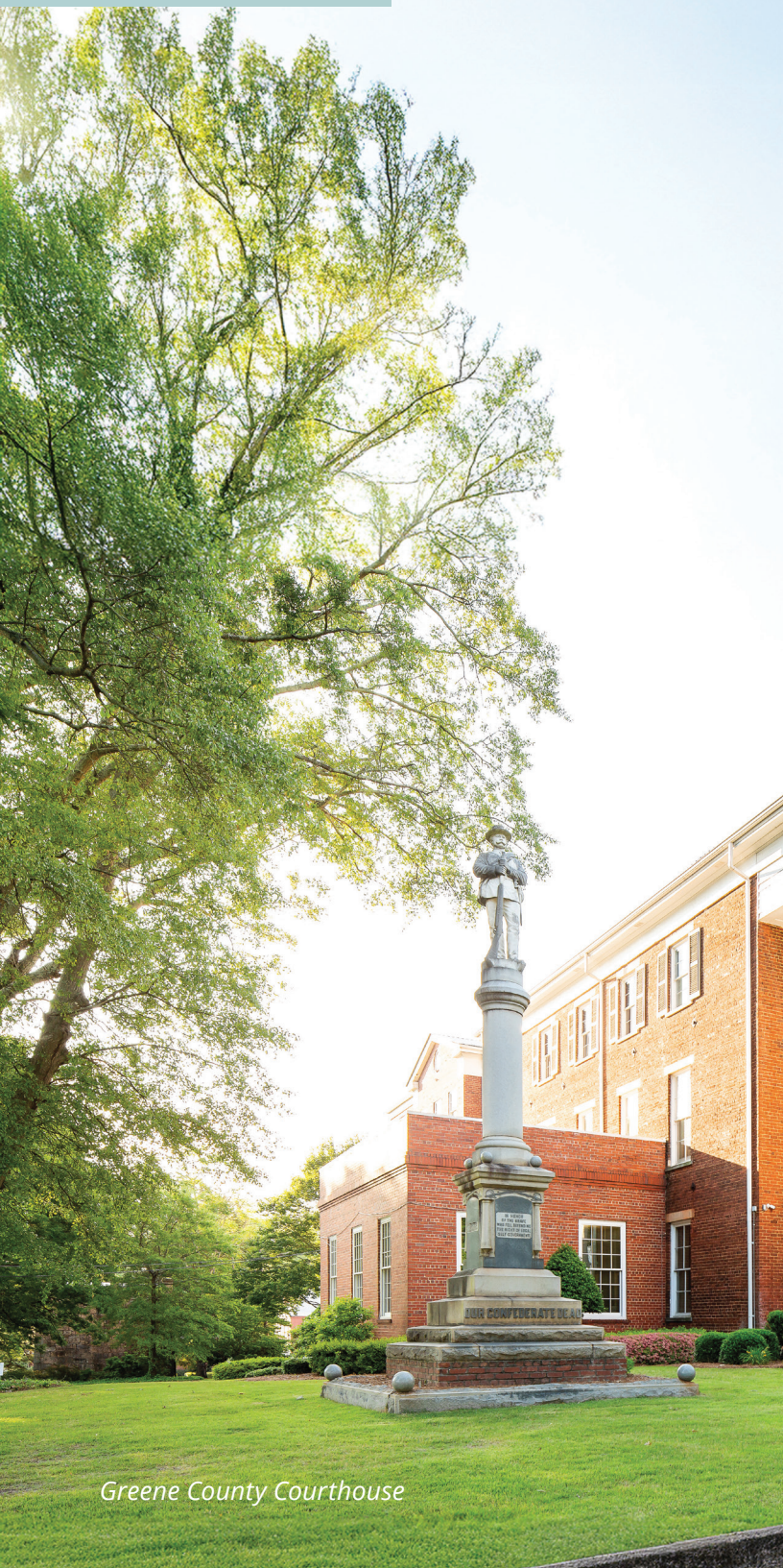
Greene County Courthouse