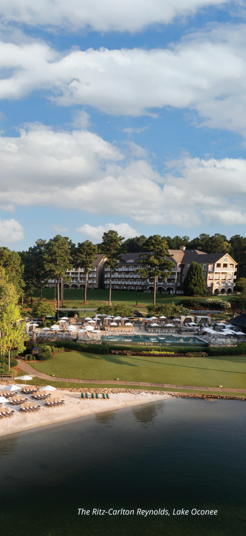
The Ritz-Carlton Reynolds, Lake Oconee