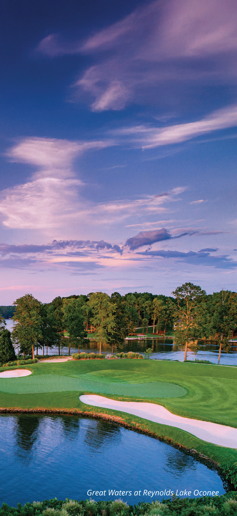
Great Waters at Reynolds Lake Oconee